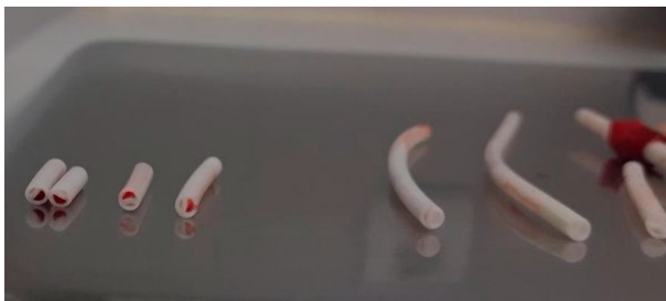
Figure 4. Thrombus reflux resulting in a catheter tip occlusion undergoing continuum infusion.

When infusion pump flow rates are increased, the negative pressure applied through the CVC lumen between pumps could aspirate the clot through the catheter tip into the lumen (Hadaway, 2005). The inappropriate drug bolus administration by aggressive flushing through the administration system could produce the same effect as well (syringe plunger rebounds and draws blood back), (Hadaway, 2005). In both cases, an aspiration clot resulting in catheter tip occlusion could be observed. (Figure 4)