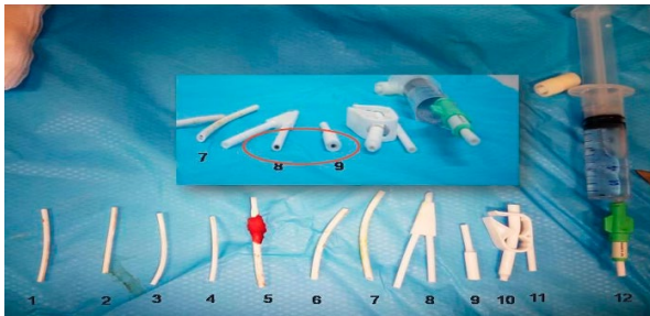
Figure 3. Aspiration clot into the CVC lumen.

When infusion pump flow rates are increased, the negative pressure applied through the CVC lumen between pumps could aspirate the clot through the catheter tip into the lumen (Hadaway, 2005). The inappropriate drug bolus administration by aggressive flushing through the administration system could produce the same effect as well (syringe plunger rebounds and draws blood back), (Hadaway, 2005). In both cases, an aspiration clot resulting in catheter tip occlusion could be observed. (Figure 4)