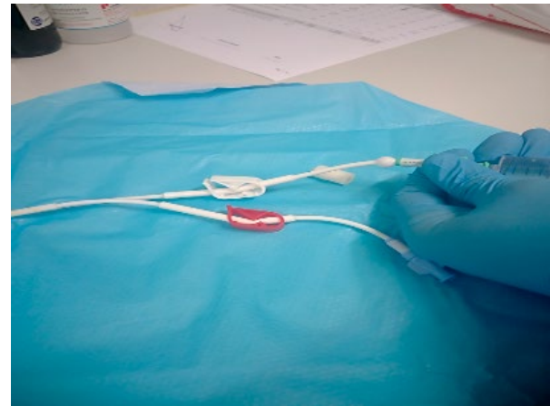
Figure 2. “Bubble” formation in the hub aspiration Clot: Infusion pumps and Aggressive flushing.

When the CVC patency was not restored and the CVC was removed, it was tested with a 10 mL syringe saline solution administration being a “bubble” formation in the hub observed. (Figure 2) The CVC was sectioned and a clot ( \pm 3 cm) in the proximal section (CVC-line bifurcation) was reported.